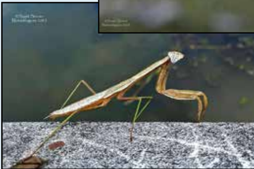
Nashville, TN 2014