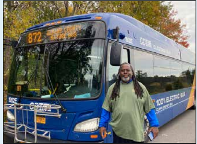
DEC Staff above; CDTA Nature Bus top right; the Five Rivers Maintenance Crew to the immediate right.