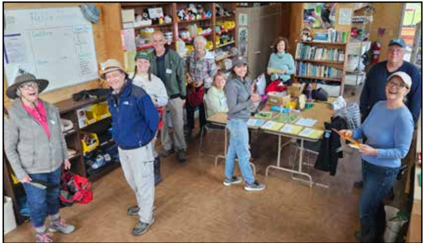
GSP Volunteer Instructors preparing to head afield.

In 2023, GSP instructors led 2,695 students and 810 adult chaperones to field, forest, stream, and pond habitats for meaningful lessons. Many of the children were on their first field trip and were full of their own anticipation. With their instructor's guidance, children pondered plant and animal life while using hand lenses. They observed and sketched unknown species. They lifted sap bucket lids and squealed with delight as their eyes caught droplets leaving the spile and splashing into the reservoir. Some moved from fear to curiosity to a tentative appreciation after sweep netting for insects in the field. Most engaged with nature in a memorable way because a GSP instructor had hope and acted upon it.