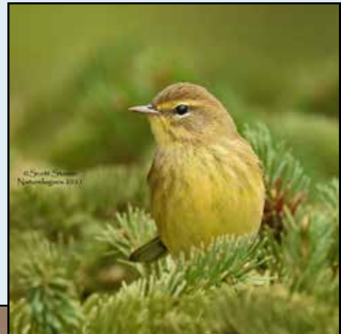
Nashville, TN 2014