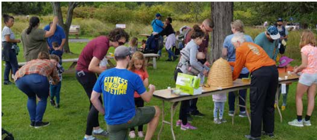
Family fun games on a beautiful Fall Festival day.